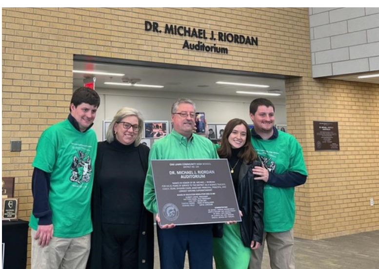
DR. MICHAEL J. RIORDAN Auditorium